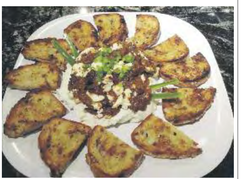
Grilled Peach-Jalapeno Compote tops a cheesy blend.

can drop off their peach creations from 9:30 to 11:30 a.m. at the information booth, and winners will be announced Aug. 17 at the market. Whether it's a favorite family dish, or a brand new concoction created just for the contest, I always love to see families cooking together and especially love seeing our local youth getting involved in these contests. I'm really looking forward to trying and publishing this year's wonderful en-