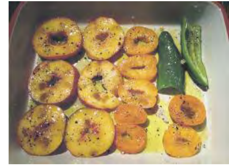
This appetizer starts with grilled peaches and jalapeno.

n the spirit of the upcoming Mor-Laga Peach Recipe Contest, my son and I decided to make an appetizer using grilled peaches and jalapenos! We topped it all with crumbled feta cheese and then broiled it to get the in time! compote warm and the cheese slightly browned. It could be served test is sponsored by the California as is, and would be delicious over Farmers' Markets Association. It has grilled chicken, but we served it as an been pushed out two weeks later than appetizer over a goat cheese/cream cheese/gorgonzola mixture and held during the Moraga Farmers' spread it on grilled honey whole Market on Sunday, Aug. 10. People tries!